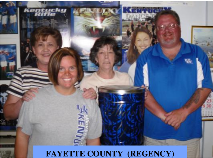
FAYETTE COUNTY (REGENCY)