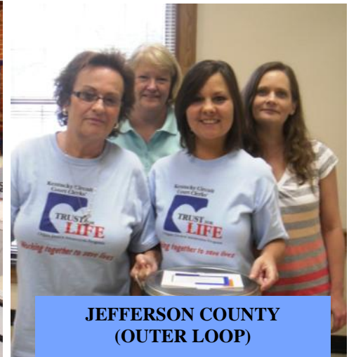
JEFFERSON COUNTY (OUTER LOOP)