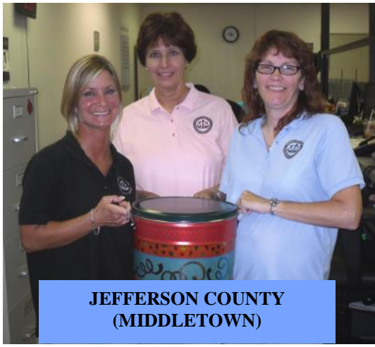
JEFFERSON COUNTY (MIDDLETOWN)