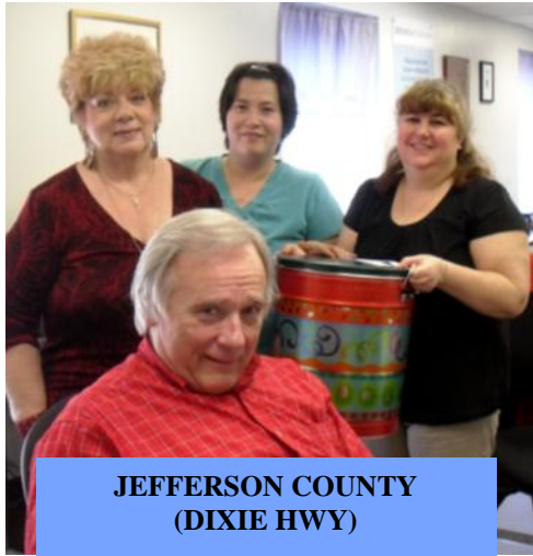
JEFFERSON COUNTY (DIXIE HWY)