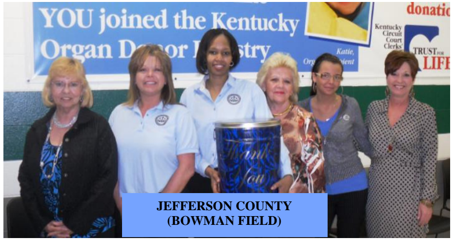
JEFFERSON COUNTY (BOWMAN FIELD)